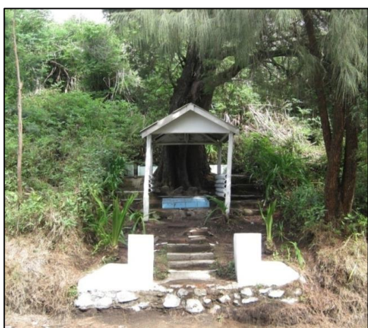
Figure 2. Pedanyangan (left) and Punden Kutungan (right) of Ngadas Village

The pedanyangan is the place where the ancestral spirits of the people of Ngadas Village. The people put offerings inside the cottage, pray to seek blessings for the villagers to be safe and safe in their bodies, or when they have intentions or wishes, especially when one is to celebrate. Below position of the pedanyangan, there is a water source. It is possible that the vegetation present in the pedanyangan is a protective spring there. The Ngadas community uses this water for daily needs. Because under the pedanyangan there are springs that also called danyang banyu .