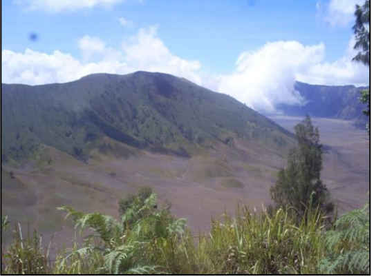
Figure 3. Crater (left) and savanna land (right) of Bromo mount